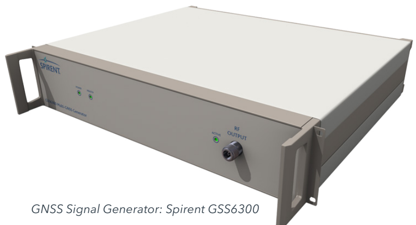
GNSS Signal Generator: Spirent GSS6300

The GSS6300 GPS/SBAS performance is equivalent to Spirent's proven GSS6100 Single Channel Production Test System. In addition, the GSS6300 offers QZSS, GLONASS, BeiDou and Galileo test capabilities to support your evolving GNSS testing needs.